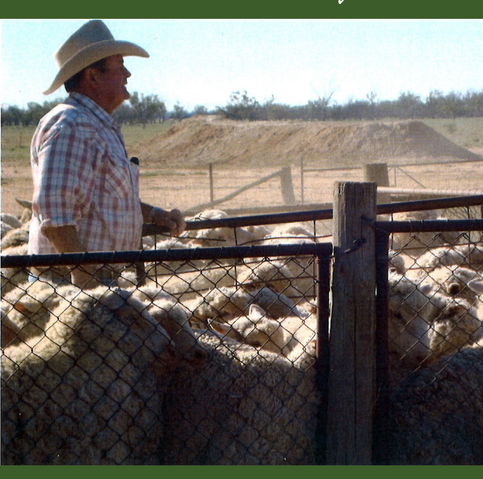
22nd August 1944 ~ 23rd March 2024 A true friend and gentleman