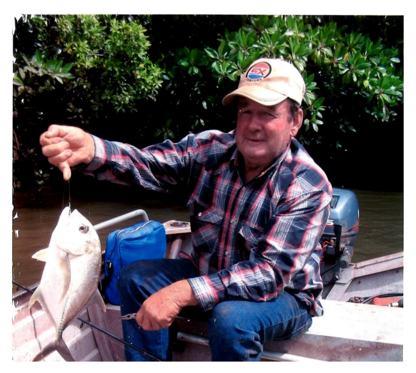
Thank you for your kind expressions of sympathy during this difficult time.

Your thoughts and presence here today have brought us great comfort.