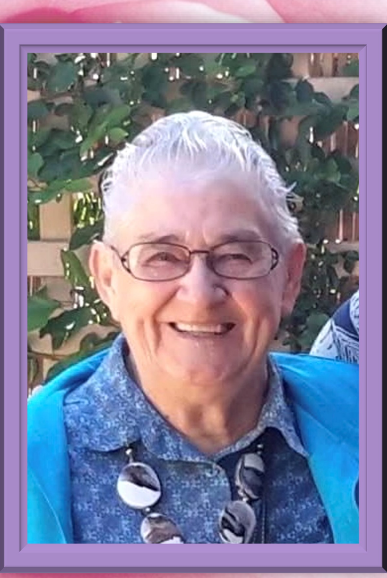
8th December 1930 ~ 15th April 2021

St Alban The Martyr Anglican Cathedral, Griffith Thursday 22nd April 2021