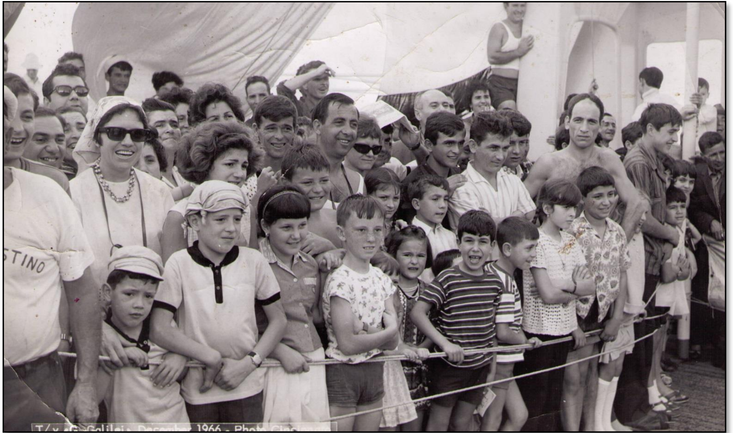
T/v G. Galilei - December 1966