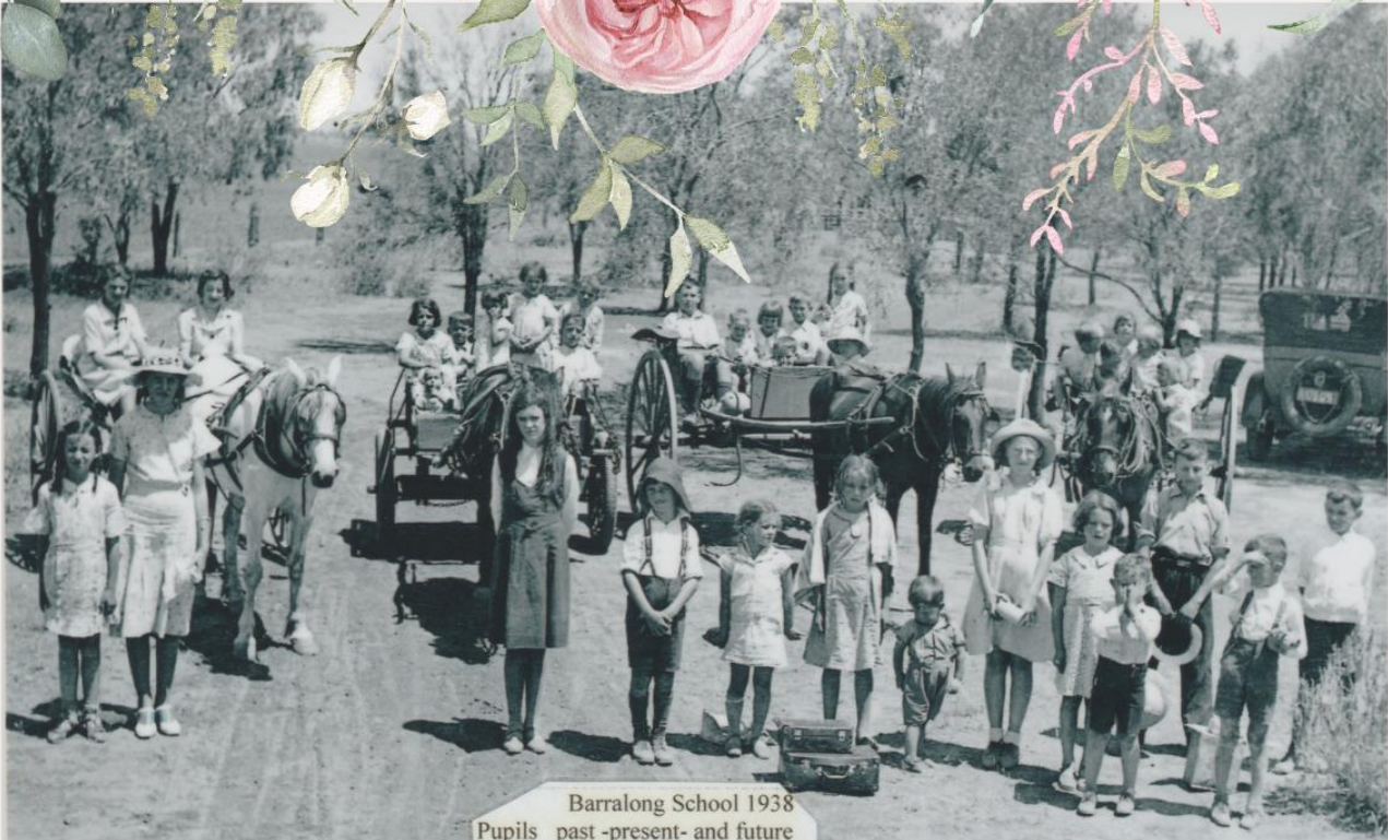
Barralong School 1938 Pupils past-present- and future In Sulkeys