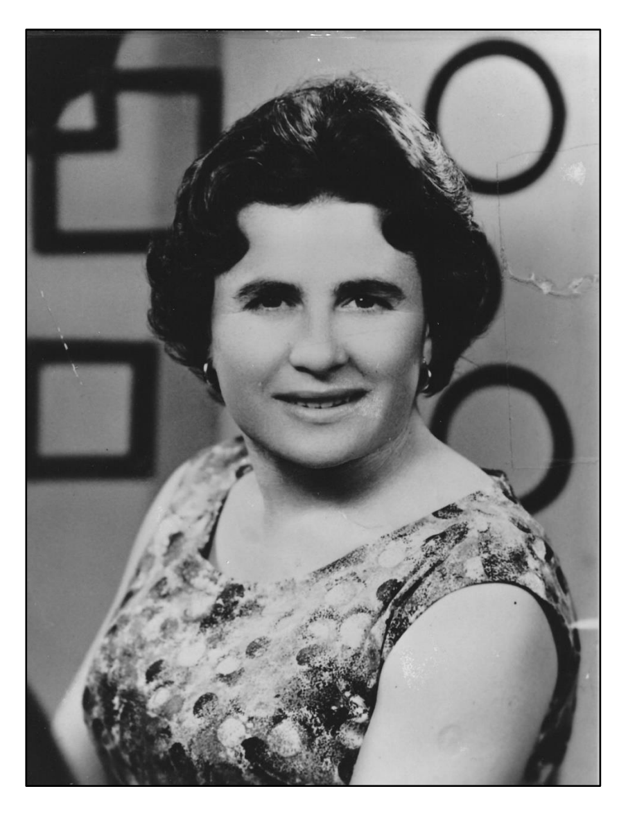
You can shed tears that she is gone or you can smile because she has lived.

You can close your eyes and pray that she'll come back or you can open your eyes and see all she's has left.