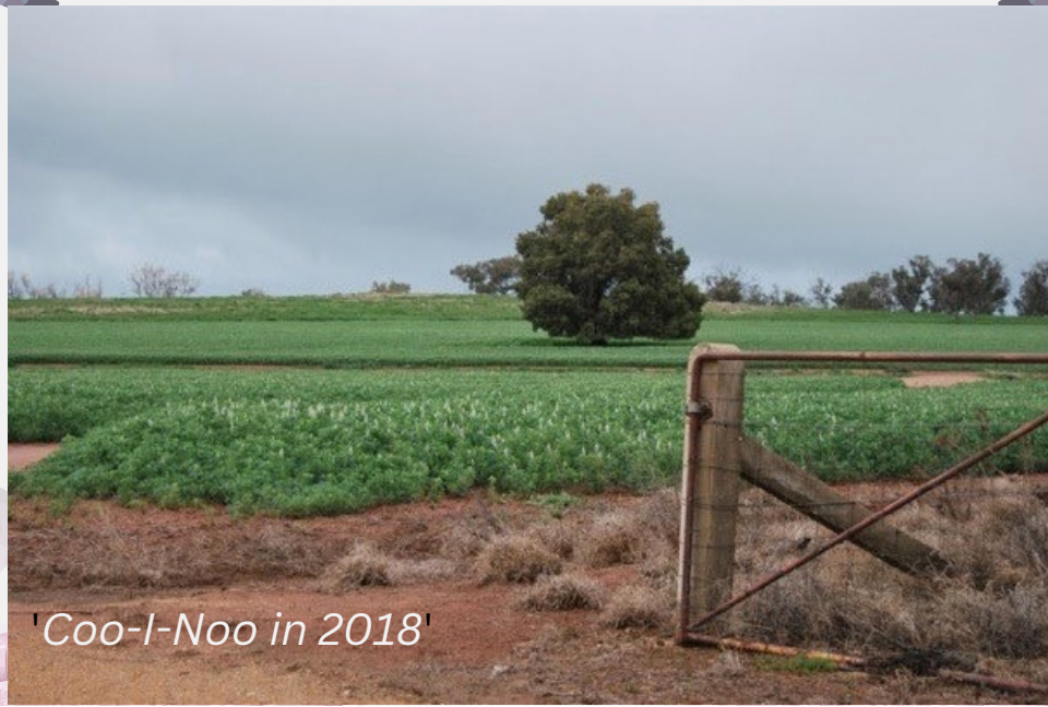
'Coo-I-Noo in 2018'